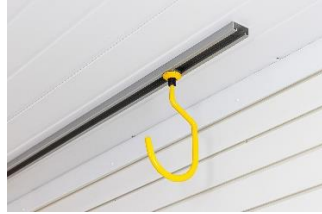
FX9001 C Hanger Hook