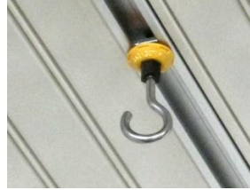
FX9002 Ring Hanger Hook