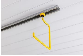
FX9000 D Hanger Hook